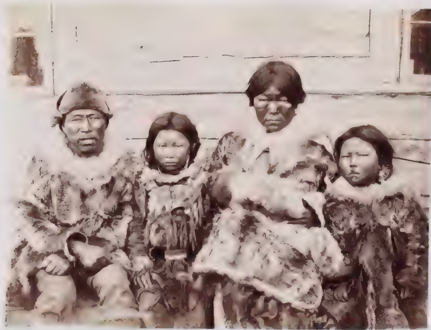
| 13. Esquiman family, uncivilized.